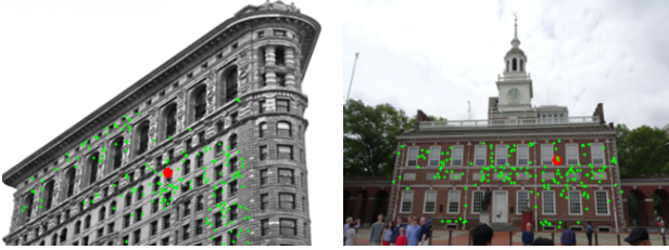
Figure 1. Visualization of produced co-planar points in MegaDepth Dataset. The red point is one anchor point \mathbf{p}_m , while the green dots are the co-planar pixels among K sampled candidates \{\mathbf{q}_n^m \mid 1 \leq n \leq K\} , computed following Eqn. 1.

Shengjie Zhu and Xiaoming Liu Department of Computer Science and Engineering, Michigan State University, East Lansing, MI, 48824 zhusheng@msu.edu, liuxm@cse.msu.edu