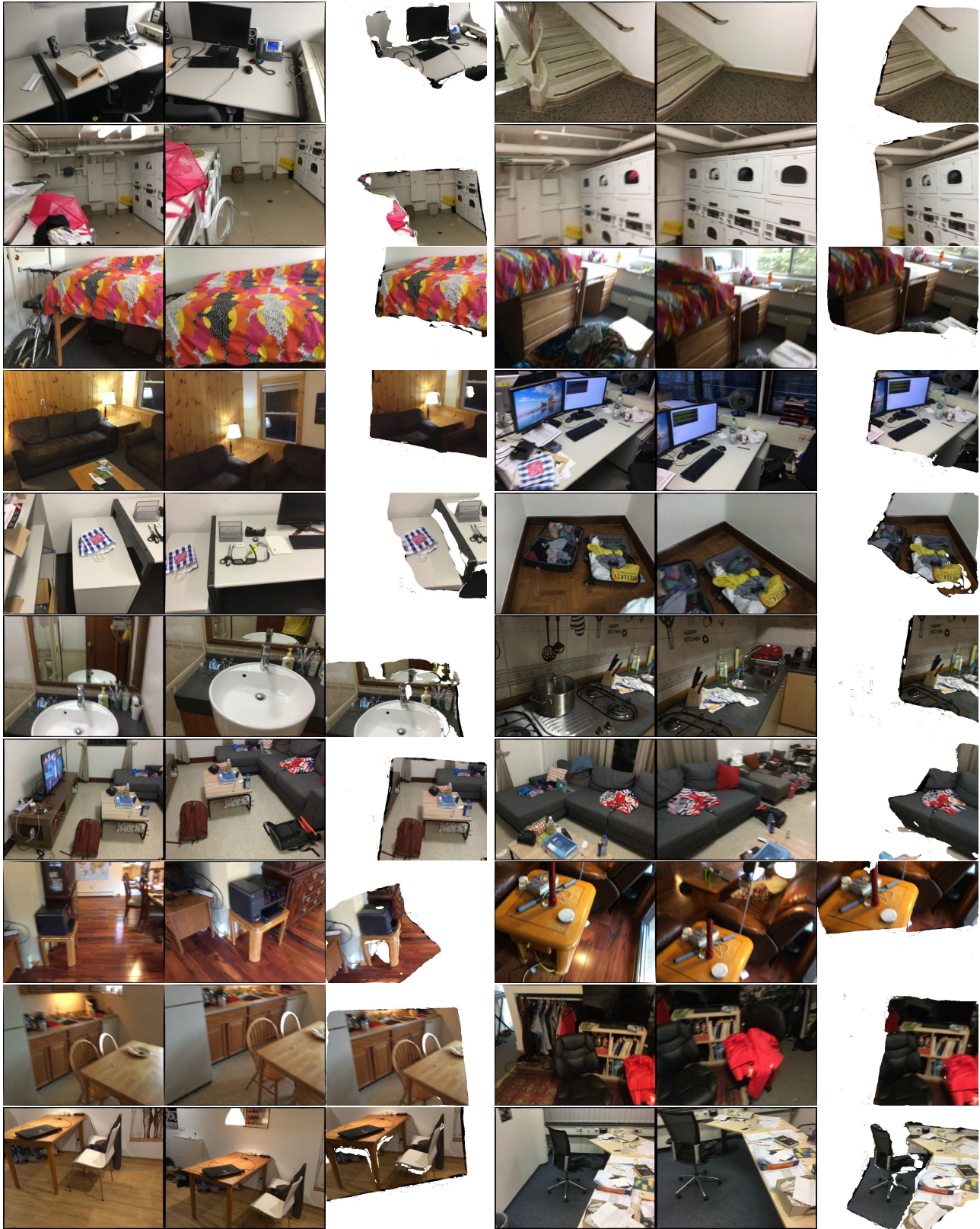
Figure 4. Visual Quality of the Reconstruction on ScanNet.